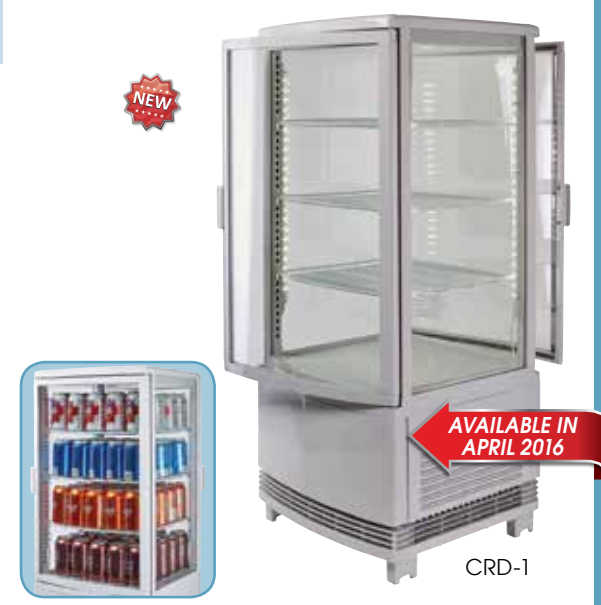
Comfortably fits 100 cans