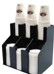
CLO-3D 12-11/16"L x 8-5/8"W x 12-1/4"H