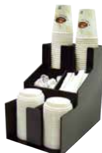
CLSO-2T 8-1/2"L x 13-1/16"W x 12-3/16"H