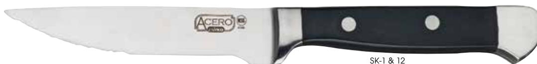
SK-1 & 12