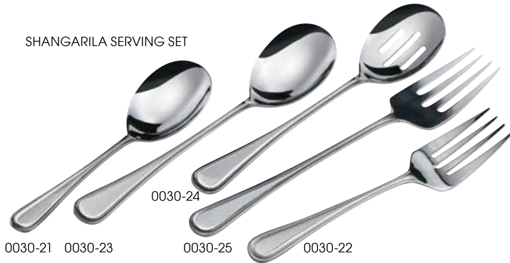
SHANGARILA SERVING SET