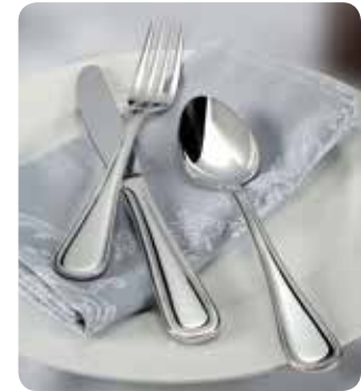
Coordinating Shangarila Flatware pieces available on page 14