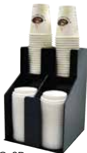
CLO-2D 8-1/2"L x 8-5/8"W x 12-1/4"H