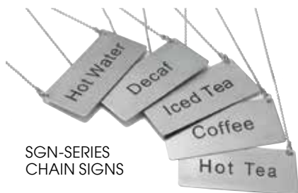
SGN-SERIES CHAIN SIGNS

With oversized black letters on stainless steel, these beverage tent and chain signs are must-haves for buffets and beverage stations.