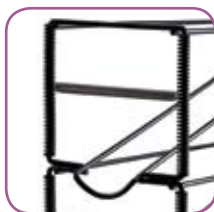
Simply twist springs to adjust for different cup sizes