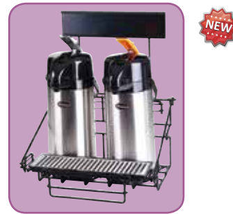
Single-tier rack can be used without feet