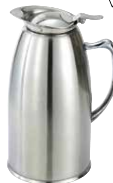
ALL STAINLESS STEEL