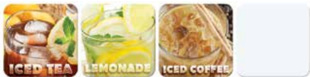
3 color and 1 blank decal included