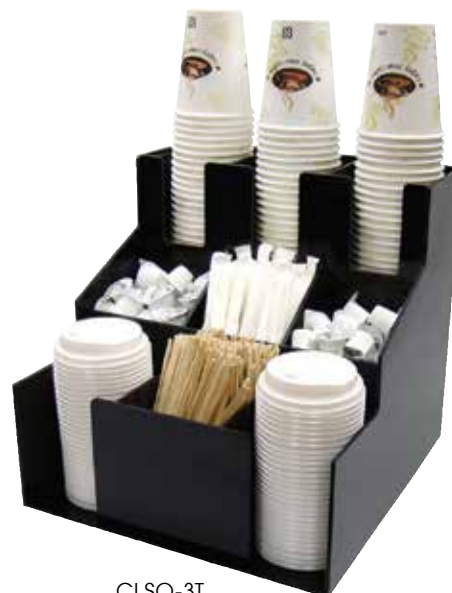
CLSO-3T 12-5/16"L x 12-3/4"W x 13-1/8"H