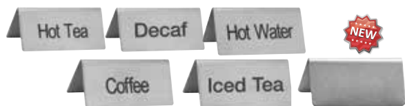
SGN-SERIES TENT SIGNS