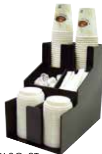
CLSO-2T 8-1/2"L x 13-1/16"W x 12-3/16"H