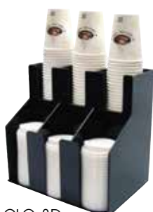
CLO-3D 12-11/16"L x 8-5/8"W x 12-1/4"H