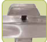
Specialty bolts secure each joint