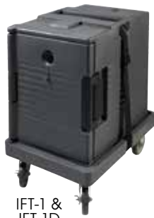
IFT-1 & IFT-1D