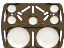
5 columns 5" plates 2 columns 9"-13" plates