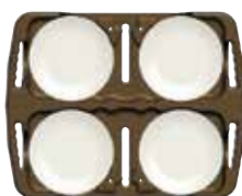
4 columns 9"-13" plates