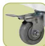
3" Caster Wheels with Brakes