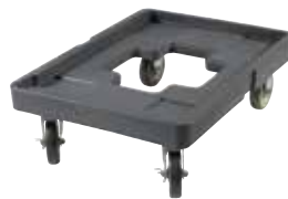
IFT-1D (INCLUDES STRAP) Can also be used with IFPC-series