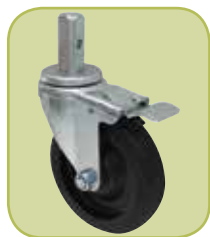
ALRC-5STK 5" caster with brake