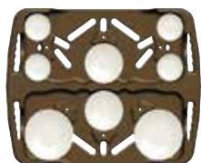
4 columns 4-1/2" plates 2 columns 5-1/2" - 7" plates 2 columns 7" - 9" plates