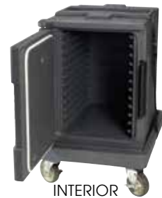
INTERIOR VIEW IFT-1