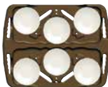
6 columns 7" - 9" plates