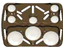
5 columns 4-1/2" plates 3 columns 7" - 9" plates