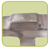
Bolt caps are welded over completely to form extra strength juncture