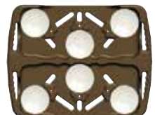
6 columns 5-1/2" - 7" plates