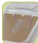
Convenient Scoop Storage