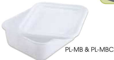
PL-MB & PL-MBC