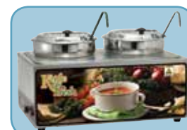
Also available without menu board