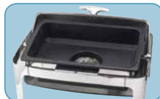
Can be used inside standard size chafers