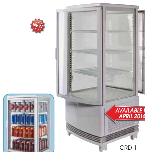
Comfortably fits 100 cans