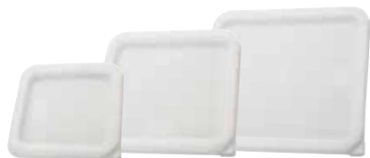
PECC-S , PECC-M, PECC-L

Winco offers a wide selection of NSF listed boxes, and containers to meet all your food storage needs. Our food storage containers come in round and square shapes in both clear polycarbonate and polypropylene.