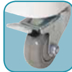
3" Caster Wheels with Brakes