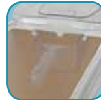
Convenient Scoop Storage