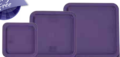
PECC-24P , PECC-68P, PECC-128P