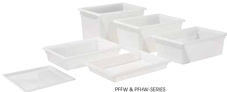
PFFW & PFHW-SERIES