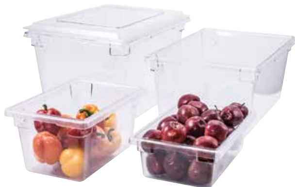
PFSF & PFF-SERIES