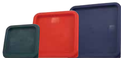
PECC-24 , PECC-68, PECC-128