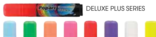
DELUXE PLUS SERIES