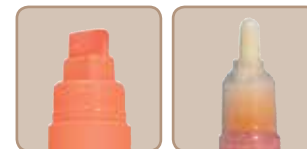
Parallel Point Markers